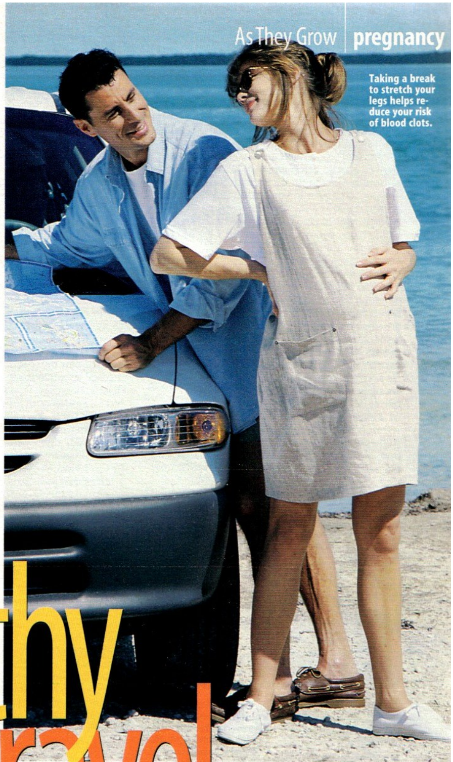
Taking a break to stretch your legs helps reduce your risk of blood clots.